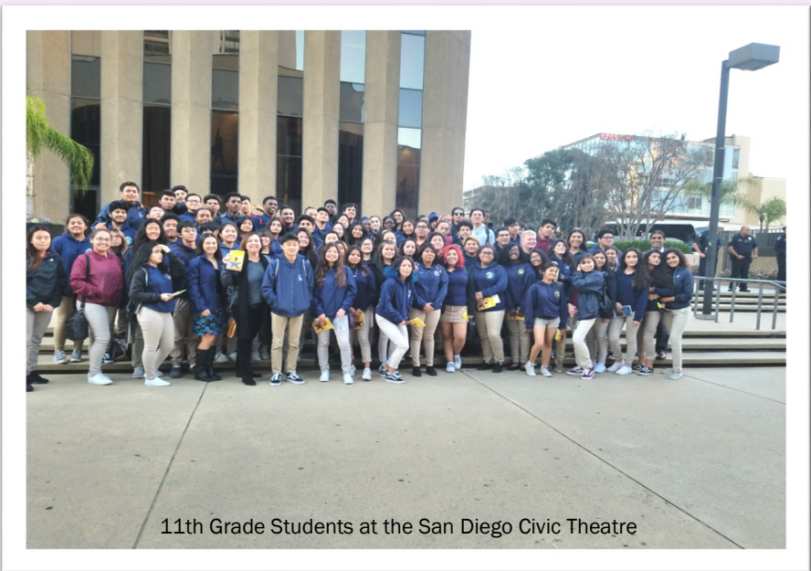
11th Grade Students at the San Diego Civic Theatre